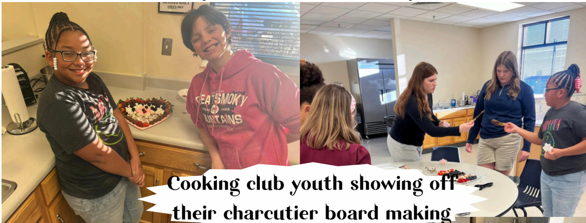
Cooking club youth showing off their charcutier board making